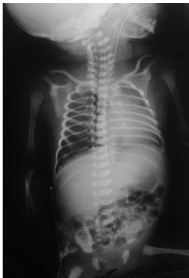
Figure 2. The second chest X-ray of neonate at first birth of day after injection of second dose of surfactant: mild hyperinflation that was decreased in comparison to previous CXR

The neonate's test for SARS-COV-2 was positive on the