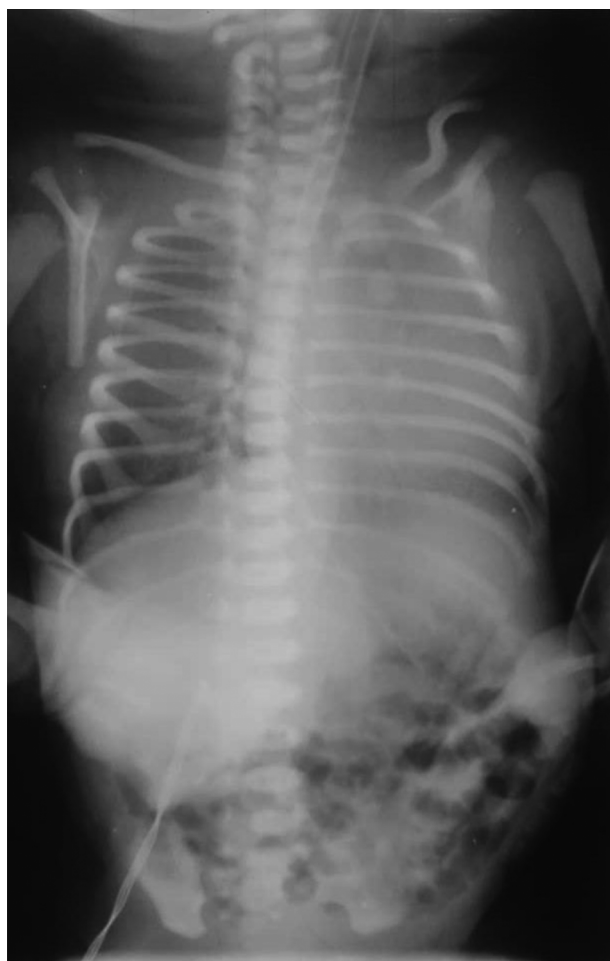
Figure 1. Except mild hyperinflation and cardiomegaly no other significant findings was visible